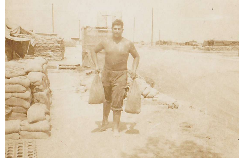
Moving Sandbags.jpg (1107x738)