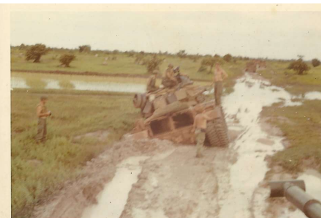
Tank Stuck in Mud.JPG (976x672)