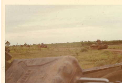
Tanks on Patrol.JPG | "The tanks. There was a time around March through May when we had shootouts every day. Or we would get shelled, or there would be booby trapped road blocks and so the tanks went with us as added protection. Often the VC would fire from the tree line or drop mortars from the tree line and the tanks would just swivel their guns and blast the tree line so we could continue our patrols." (Thanks to Tom Petro for the recollections.) (976x688)