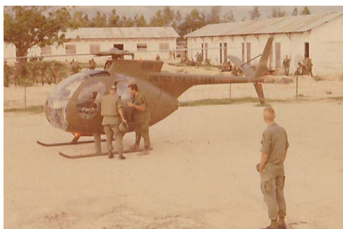
Small Helicopter.jpg (795x530)