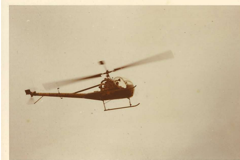
Small Helo.JPG (976x688)