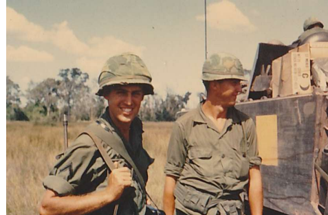
Hanging out behind a track.jpg (840x559)