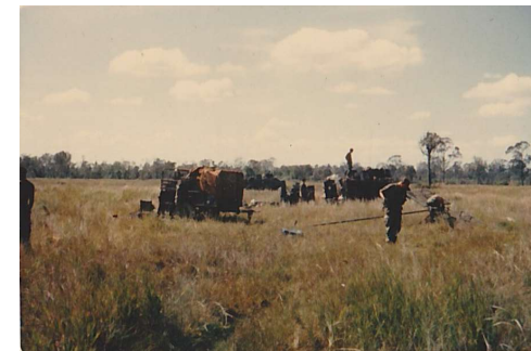
Setting up an Antenna.jpg (906x604)