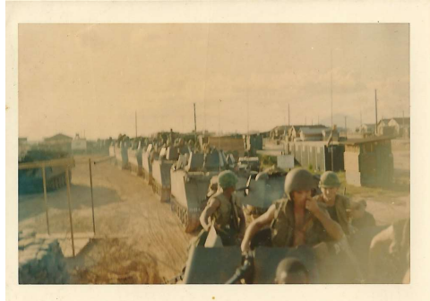
Mounted Patrol (2).JPG | Tracks lined up to leave the motor pool of Tay Ninh or Dau Tieng. (Thanks to Tom Petro for the recollections.) (1013x713)