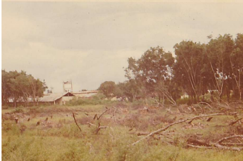
Buildings in the distance.jpg (918x610)