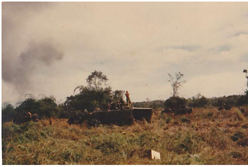
Watching Impacting Rounds.jpg (863x575)