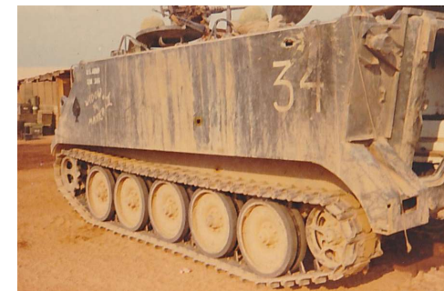
Damaged -Widow Maker-.jpg (913x607)