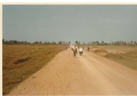
Dismounted on Roadway.JPG | Dismounted patrol to protect the engineers who were sweeping the road for mines. (Thanks to Tom Petro for the recollections.) (976x672)