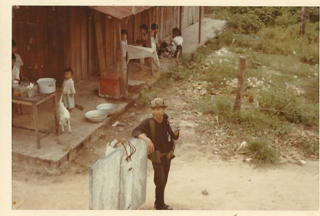
Vietnam Civilian.JPG (992x672)