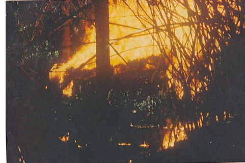
Burning Hooch close up.jpg (900x600)