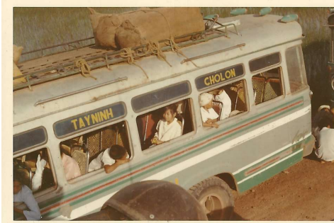
Vietnam Bus.JPG (976x672)