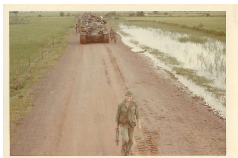
Dismount during Mounted Patrol.JPG (1017x687)