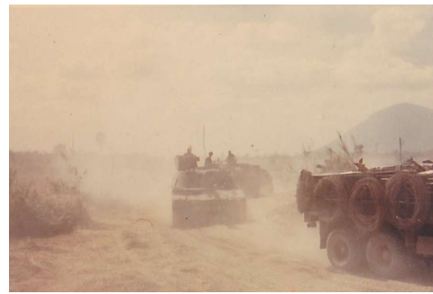
M109 Howitzer.jpg (892x595)