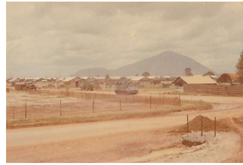
Black Virgin Mountain.jpg (908x606)