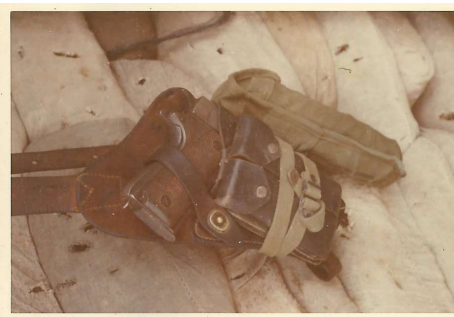
Colt .45.JPG (976x672)