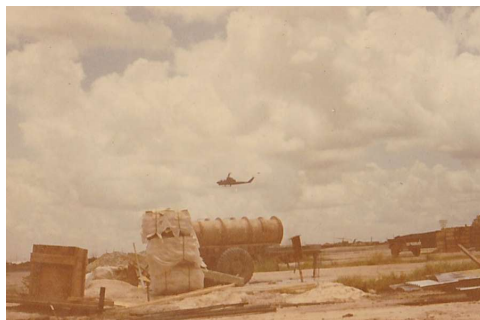
Cobra Attack Helicopter.jpg (904x603)