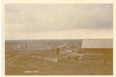
Bunkers.JPG | A view of the outhouses at Dau Tieng base camp by the motor pool. (992x688)