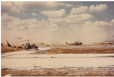
Hueys Landing.jpg (885x590)