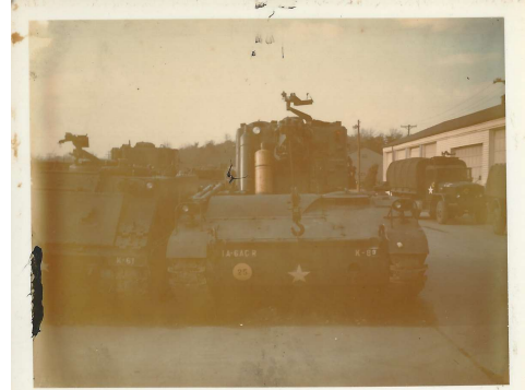
Recovery Vehicle.JPG | Tank Retriever (1232x976)