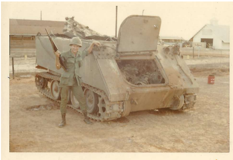
Posing with a damaged M113.JPG | M113 that was damaged by an RPG during an ambush. (Thanks to Tom Petro for the recollections.) (992x672)