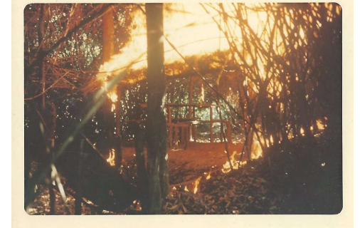
Burning Hooch.JPG (992x672)