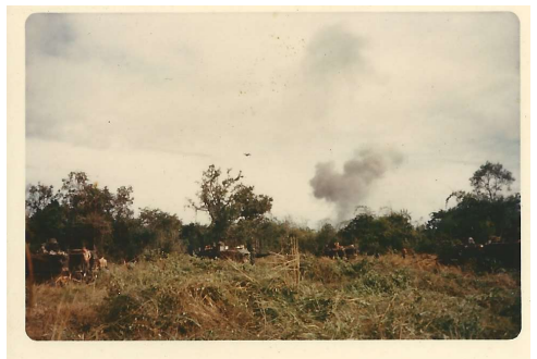
Explosion in the distance.JPG (976x672)