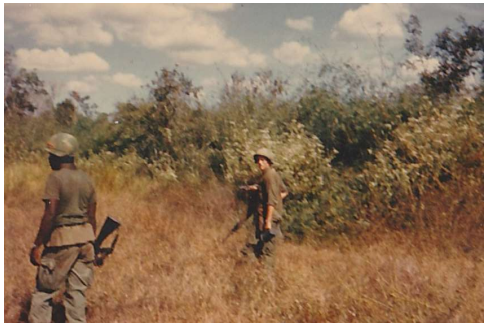
Posing while dismounted.jpg (852x569)