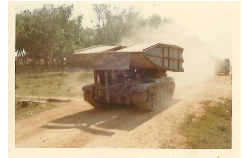
Bridge Vehicle.JPG (992x688)