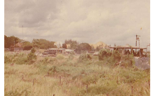
Perimeter Bunker.jpg (907x603)