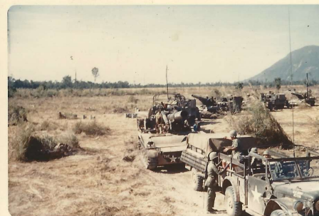
SP Artillery Pieces.JPG | Artillery coming in to set up operations at Fire Base Grant, notice Nui Ba Den in the background. (Thanks to Tom Petro for the recollections.) (992x672)