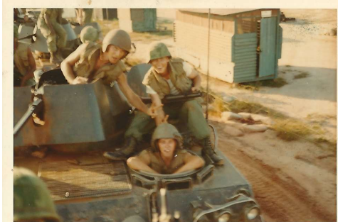
Fooling Around before a Patrol.JPG (976x688)