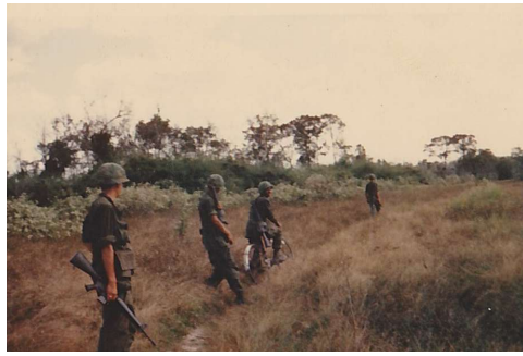
Biking on Patrol.jpg (927x616)