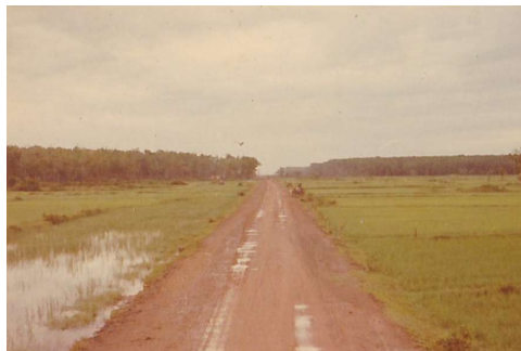
Road to Dau Tieng.jpg (887x590)