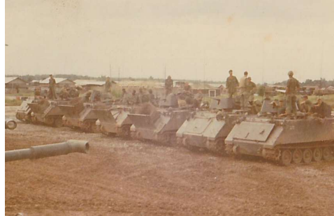
Recon Platoon Motorpool.jpg (859x572)