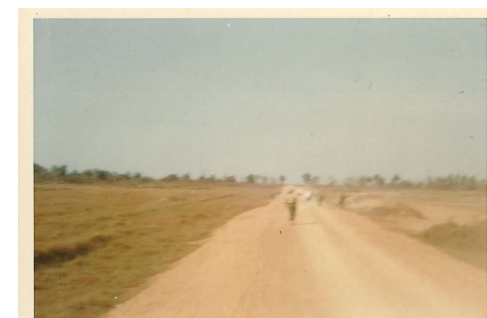
Dismounted Patrol on Roadway.JPG | Dismounted patrol to protect the engineers who were sweeping the road for mines. (Thanks to Tom Petro for the recollections.) (976x672)