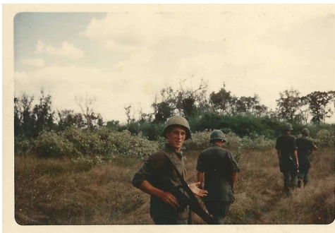
Dismounted Patrol.JPG (976x672)