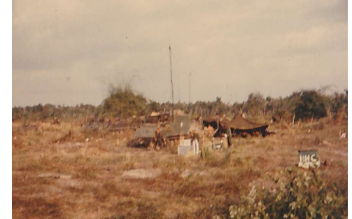
HHC M577.jpg (883x589)