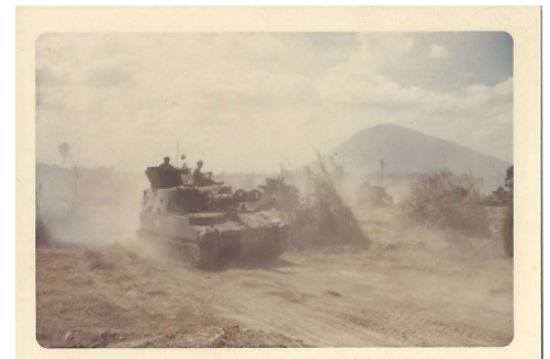
M109 SP Artillery.JPG | "The track mounted 155 mm arty? When we would be out in a battalion size operation they would roll with us. And after setting up would supply close arty ground support to the infantry companies patrolling the area. Also H & I's, it was hard to sleep at night or nap during the day with these big guys going off all day and all night." (Thanks to Tom Petro for the recollections.) (1021x694)