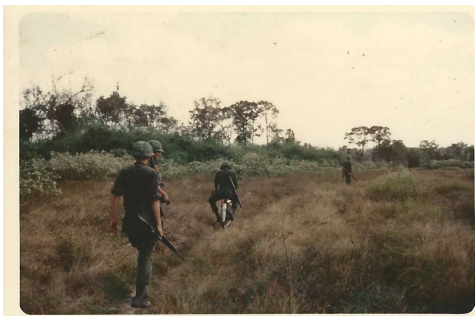
Riding a Bike on a Patrol.JPG (976x672)