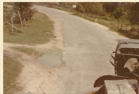
Roadway.JPG | "Paved road, blacktop, that was the approach to the suburbs of Tay Ninh city, and we all breathed a sigh of relief when we got to that point, that meant we were safe." (Thanks to Tom Petro for the recollections.) (976x672)