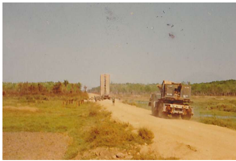
M60 ALVB.jpg (844x563)